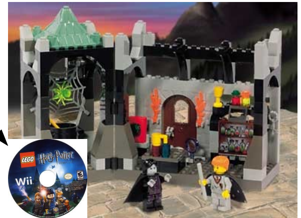
Snape keeps you after class, lose a turn