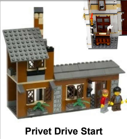
Privet Drive Start